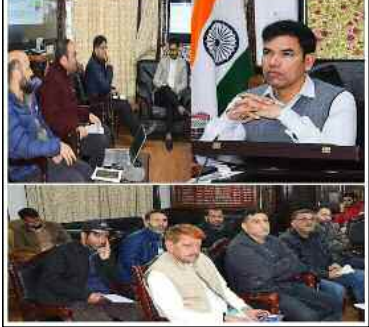
including Hokersar Wetland, Nowgam Jheel, Higam Jheel, Narkara Numbal, Anchar Lake,

At the outset, the concerned officers of I&FC gave a detailed presentation wherein they gave an overview of inundation areas of September 2014 flood, affected areas viz landuse and flood zoning of area to regulate human activity besides overall status & mapping of flood basins